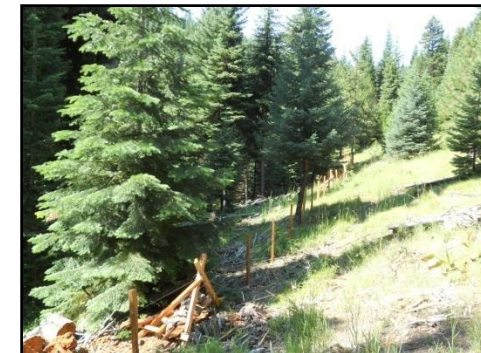
Bruin Creek Riparian Fence