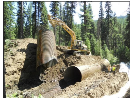
Battle Creek Culvert Replacement