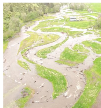
Catherine Creek April 2017, First Spring Flow