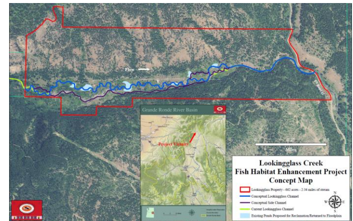
Lookingglass Conservation Property Conceptual Restoration Plan